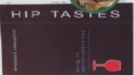
" Hip Tastes: The Fresh Guide to Wine " $12.21

Those snap-on pourers fit any bottle and totally prevent dripping. They're handy when you're moving fast, refilling glasses around the room—and great protection for your ego too. Vinix Vin crystal wine servers $4.99/SET OF TWO